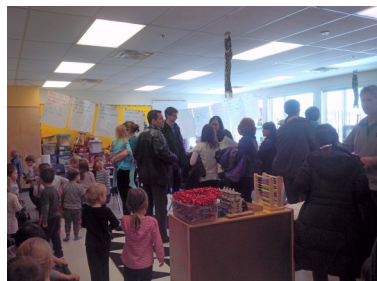
It was standing room only at the annual JK Open House!