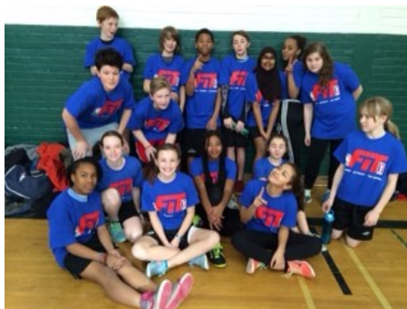
Our students participated in NBA Fit, as part of All-Star week festivities. Former NBA star Glen Rice was on hand to help motivate students to continue pursuing a healthy and active lifestyle, and good nutrition habits.