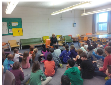
The students of Grade 5 got to learn about government first-hand from Parkdale-High Park MPP Cheri Di Novo