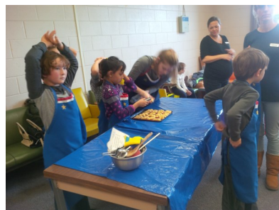
Grade 3's did some hands-on learning in an Acadian cooking class!