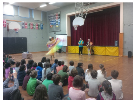
Tribal Vision: Visions of Turtle Island