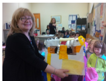
Celebrating Chinese New Year!