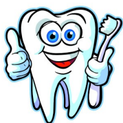
Toronto Public Health completed it's annual screening of Humbercrest students. A total of 679 students were examined over the course of several days. And the results show that our kids have great teeth!