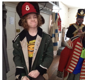
Senior students visited Fort York!